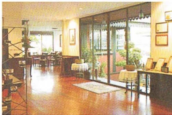
Baan Khung Ying